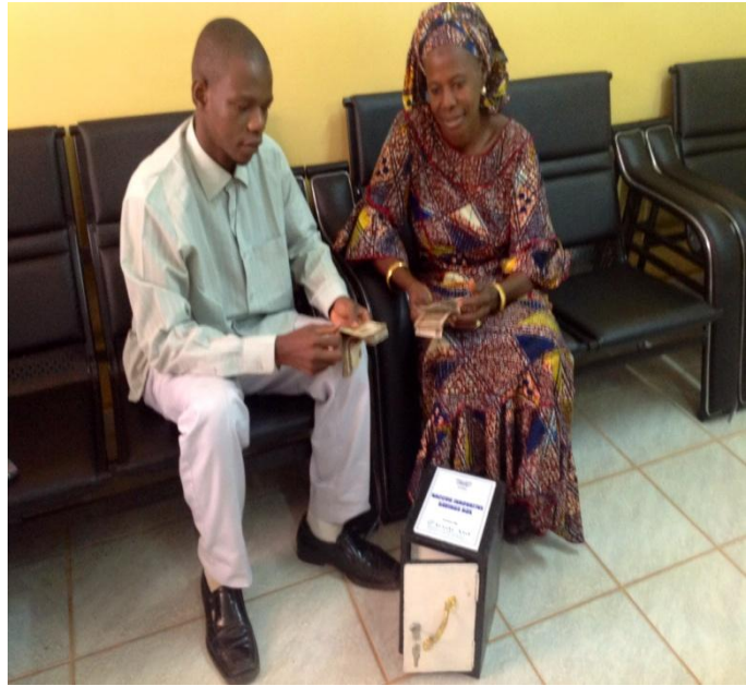
Photo above: Sofora CU Manager with a beneficiary counting cash from the Saving Box.

NACCUG provided the Credit Union with 10 Innovative Savings Boxes in November 2013 which were subsequently distributed to 10 female members by the CU Board. The chart below shows the savings trend of the beneficiaries from November 2013 to date.